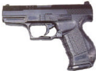
Airsoft Walther P99 – A Toy

The reason toy manufacturers use red tips on toy gun barrels was because too many children were killed or injured when they refused to put down a toy gun if confronted by a Police Officer. Unfortunately, Police Officers couldn't distinguish between real or toy guns with split second accuracy. If they are in jeopardy, they need to neutralize the threat regardless of age.