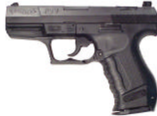
Walther P99 – The Real Thing

terminal results of firing a real bullet vs. a plastic BB opened my eyes to a whole new series of potential problems with kids today, which is why I'm writing this. I'm hoping that you as parents will realize this and do something to keep your kids or someone else's safe.